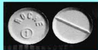
Rohypnol tablets are white and are single- or cross-scored on one side with “ROCHE” and “1” or “2” encircled on the other.

Police Departments in several parts of the country report that after ingestion of “roofies” several young women have reported waking up in frat houses with no clothes on, finding themselves in unfamiliar surroundings with unfamiliar people, or having been sexually assaulted. An amnesia-producing effect of “roofies” may prevent users from remembering how or why they took the drug or even that they were given it by others. This makes investigation of sexually related or other offenses very difficult and may account for repeated reports of “date rapes” involving the use of this drug.