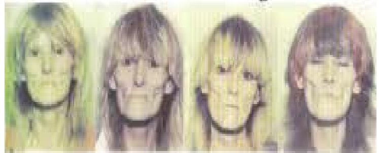
Dead - Age 38 - 1989