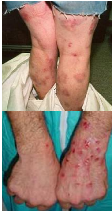
METHAMPHETAMINE CAUSES "HISTAMINE" REACTION

The meth is first placed into the chamber and heated with a lighter or heat source until it turns into a gas. The opening in the chamber and vent hole are sealed with the finger while the crystal is being heated. Once the crystal has turned to gas, it is inhaled by the user. A telltale sign of a meth user are the burn marks on the fingers used to seal and hold the main chamber. One might also see a flat spot on the thumb from using the flint on a lighter repeatedly.