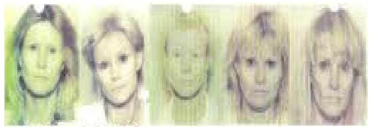
1979 - Age 28

For relief of dry mouth one should avoid beverages and food containing sugar. There are many medical causes of dry mouth and teeth decay. Poor personal dental hygiene also contributes to this problem.